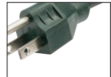
SU-P-234 - 6' with NEMA 5-15 plug Included